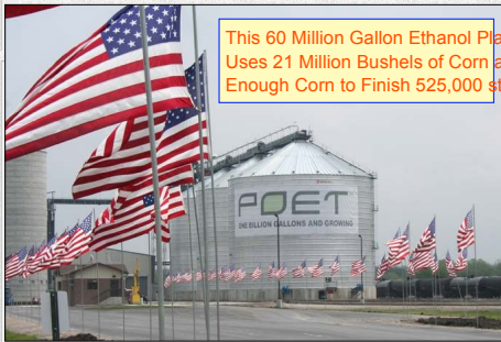
This 60 Million Gallon Ethanol Plant Uses 21 Million Bushels of Corn a year Enough Corn to Finish 525,000 steers