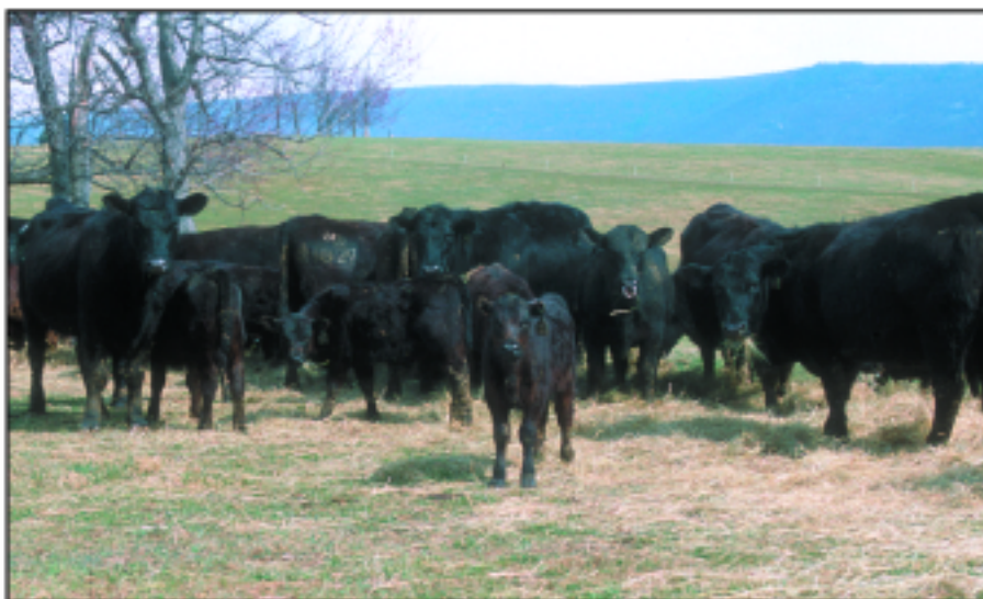
► Wehrmann Angus is known for complete cattle — cattle that will work in almost any environment.