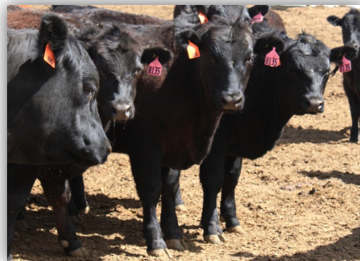
Table 1 shows the potential cost savings to the US beef cattle industry that could occur with selection for feed intake, feed efficiency, growth, and carcass traits. Calves and yearlings selected for residual feed intake (RFI) have the same ADG but eat less feed thus saving feedlot operators money. Assuming 27 million cattle are fed per year and that 34% of cattle in the feedlot are calves and 66% are yearlings, the beef industry could save over a billion dollars annually by reducing daily feed intake by just 2 lb. per animal.

The traits that beef producers routinely record are outputs which determine the value of product sold and not the inputs defining the cost of beef production. The inability to routinely measure feed intake and feed efficiency on large numbers of cattle has precluded the efficient application of selection despite moderate heritabilities ( h^2 = 0.08-0.46 ). Feed accounts for approximately 65% of total beef production costs and 60% of the total cost of calf and yearling finishing systems. The cow-calf segment consumes about 70% of the calories; 30% are used by growing and finishing systems.